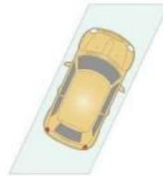
CAR SPACE 13 SQM